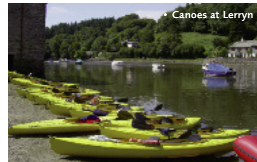
• Canoes at Lerryn