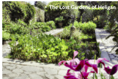
• The Lost Gardens of Heligan