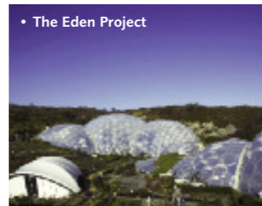
• The Eden Project